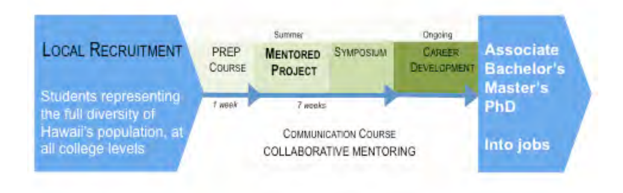
Figure 1. Akamai Internship Program Model

The Akamai Internship Program model begins with a preliminary 1-week PREP course for interns prior to their completing a mentored project over 7 weeks at a STEM job site. The internship component ends with regionally based symposium during which interns give succinct, ten-minute presentations on their projects. There is an ongoing Communication Course that spans the entire 8 weeks including the PREP course and mentored project. After completing those components, Akamai provides ongoing Career Development such as occasional workshops, assistance with conference presentations and networking. These elements are graphically portrayed in Figure 1.